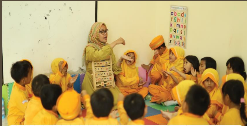
Learning alphabet and numbers