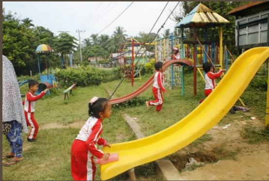
Playing & Sport