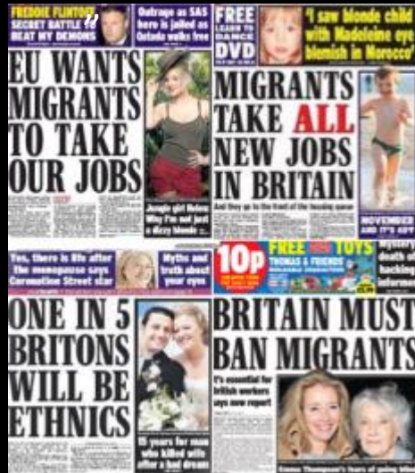
Role of the Media

One Example from seeing the Migrants as the „Other“