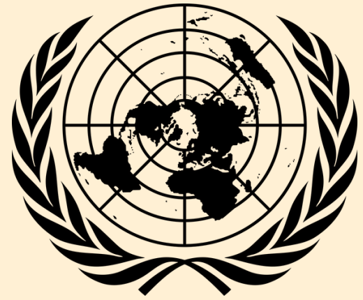
The UN Logo